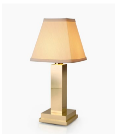
Lacquered Solid Brass with Cotton Shade