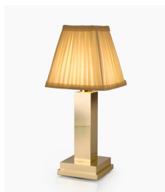
Lacquered Solid Brass with Pleated Silk Shade