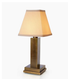
Natural Aged Brass with Cotton Shade