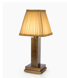
Natural Aged Brass with Pleated Silk Shade