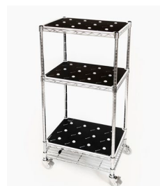
Medium Recharging Station 36 Lamps