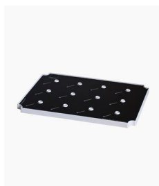
Large Recharging Tray 12 Lamps