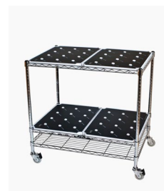
Large Recharging Station 48 Lamps