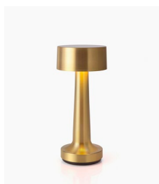
Lacquered Real Brass