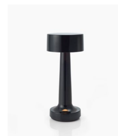
Anodised Satin Black Aluminium