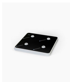
Small Recharging Tray 4 Lamps