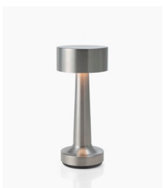
Anodised Silver Aluminium