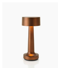
Anodised New Bronze Aluminium