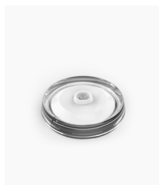
Single Lamp Charger 1 Lamp