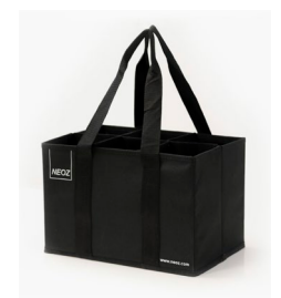
Handling Accessory 6 Lamp Carrier (Optional)

NEOZ Bringing together - Food, People, Places. www.neoz.com