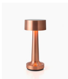
Lacquered Real Copper