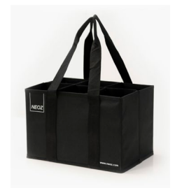
Handling Accessory 6 Lamp Carrier (Optional)