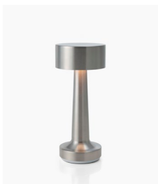
Anodised Silver Aluminium