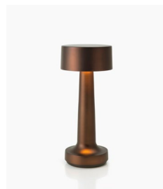
Anodised Satin Bronze Aluminium