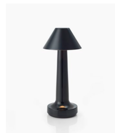
Anodised Satin Black Aluminium