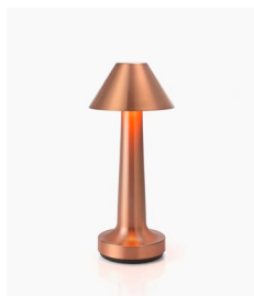
Lacquered Real Copper