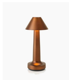
Anodised New Bronze Aluminium