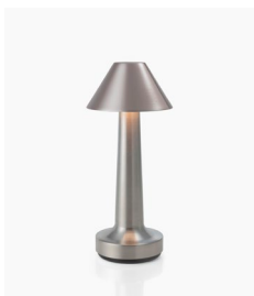
Anodised Silver Aluminium