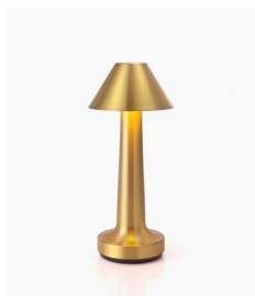
Lacquered Real Brass