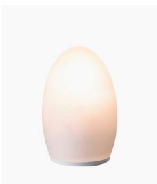
Sand Blasted Hand Blown Glass