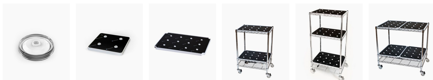
Single Lamp Charger 1 Lamp

100 - 240V Switch-Mode Electronic Power Supply Approved for worldwide usage supplied with appropriate mains electric plug type