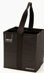
Handling Accessory 4 Lamp Carrier (Optional)

Neoz Cordless Lighting Designed and made in Sydney Australia www.neoz.com