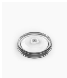
Single Lamp Charger 1 Lamp

100 - 240V Switch-Mode Electronic Power Supply Approved for worldwide usage supplied with appropriate mains electric plug type