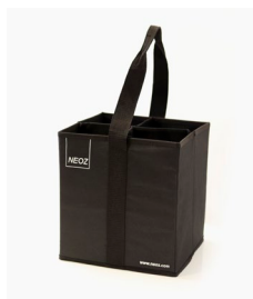
Handling Accessory 4 Lamp Carrier (Optional)