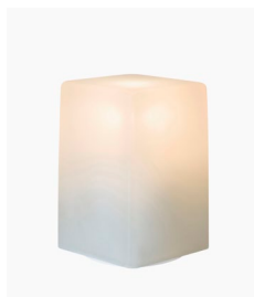
Handmade Resin Opal