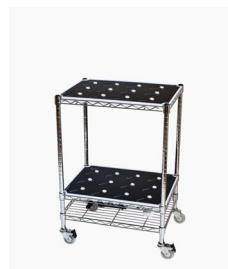
Small Recharging Station 24 Lamps