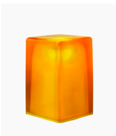
Handmade Resin Amber