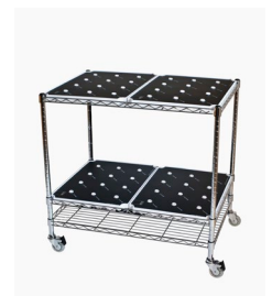
Large Recharging Station 48 Lamps