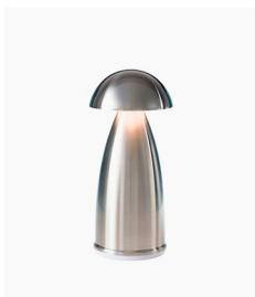
Anodised Stainless Steel