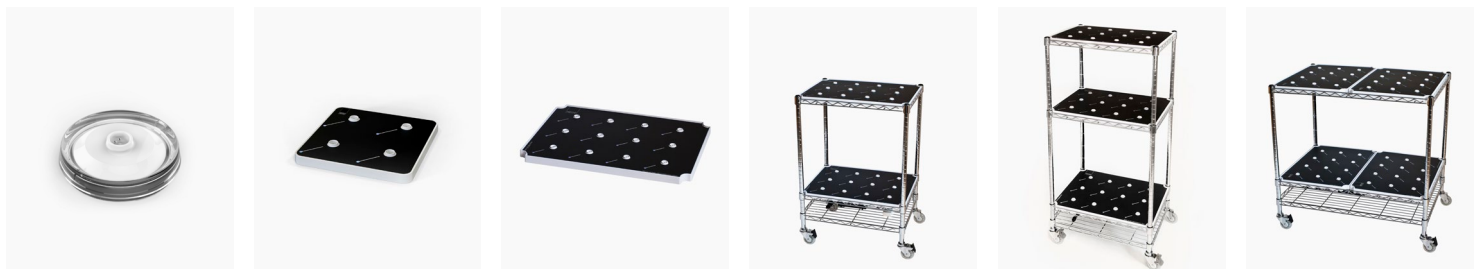
Single Lamp Charger 1 Lamp Small Recharging Tray 4 Lamps Large Recharging Tray 12 Lamps Small Recharging Station 24 Lamps Medium Recharging Station 36 Lamps Large Recharging Station 48 Lamps

POWER SOURCE 100 - 240V Switch-Mode Electronic Power Supply Approved for worldwide usage supplied with appropriate mains electric plug type