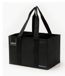
Handling Accessory 6 Lamp Carrier (Optional)