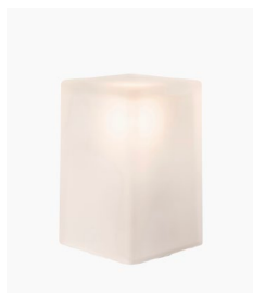
Sand Blasted Pressed Glass