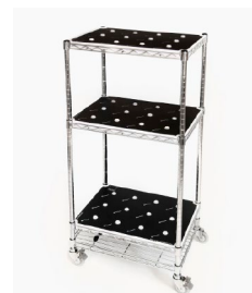
Medium Recharging Trolley 36 Lamps