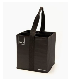
Handling Accessory 4 Lamp Carrier (Optional)