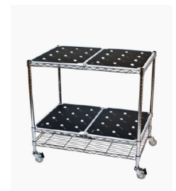
Large Recharging Trolley 48 Lamps