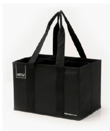
Handling Accessory 6 Lamp Carrier (Optional)