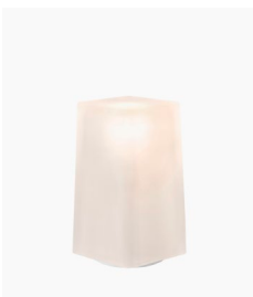
Sand Blasted Pressed Glass