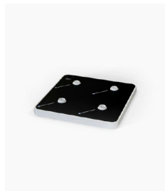
Small Recharging Tray 4 Lamps