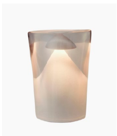
Hand-Made & Polished Natural Clear Resin