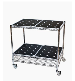
Large Recharging Trolley 48 Lamps