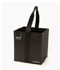
Handling Accessory 4 Lamp Carrier (Optional)