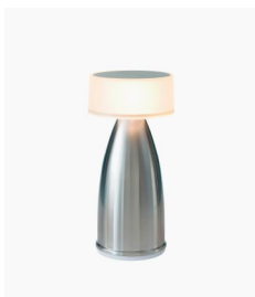
Anodised Stainless Steel