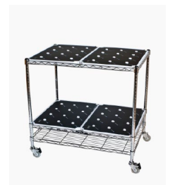
Large Recharging Trolley 48 Lamps