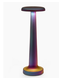
Physical Vapor Deposition Reef Great Barrier Reef Foundation Special Edition - Limited to 250 pieces