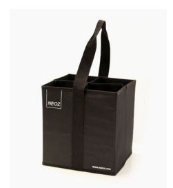
Handling Accessory 4 Lamp Carrier (Optional)