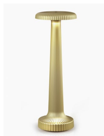
Electroplated Satin Brass