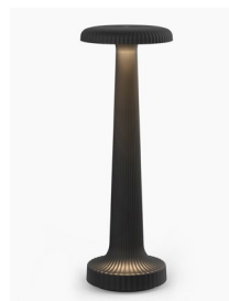
Painted Satin Black