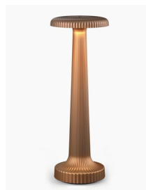
Painted Satin Bronze