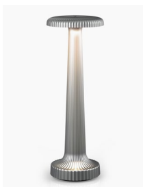
Electroplated Satin Silver